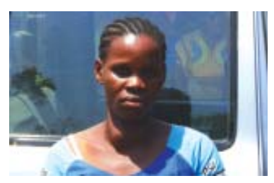
Handling gender based violence--8