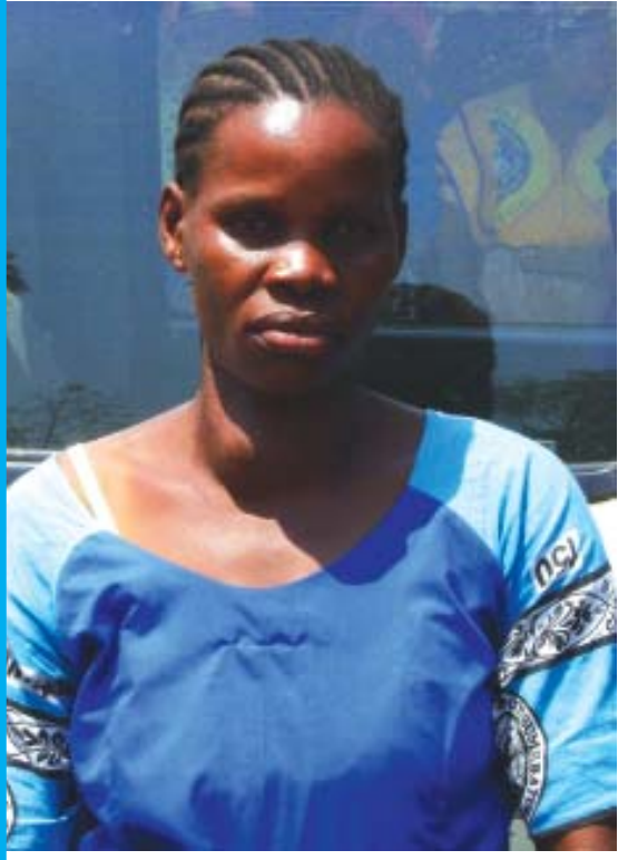
Mungomo helped one couple that was breeding ground for gender based violence

As of October 2010, she had successfully helped 16 couples from her community to resolve their gender based violence problems.