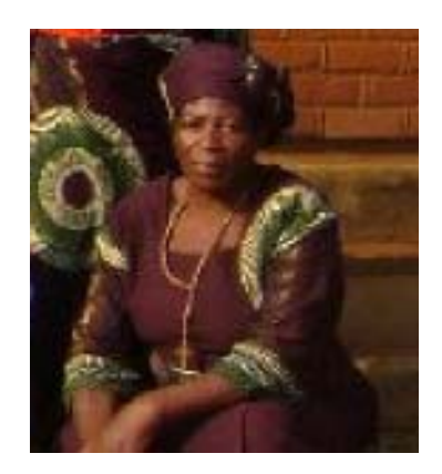
Fighting stigma and discrimination stepping stones way--5